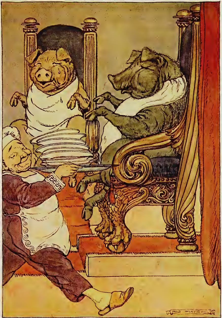
It looked so intolerably absurd to see hogs on cushioned thrones